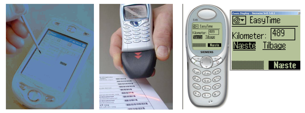
Fig 1 The three systems in test: PDA, mobile phone with barcode reader and ordinary mobile phone.

We followed the implementation process of three different systems, based on mobile devices, which were tested in three different companies. Company 1 tested a system based on mobile phones with barcode readers. Company 2 tested a system based on PDA's and company 3 tested a system based on ordinary mobile phones. See fig. 1. Experiences from the three companies are described below.